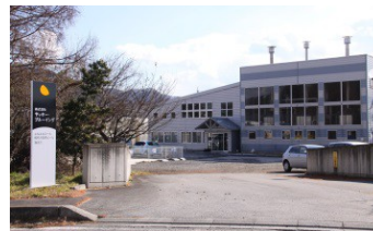
Overview of Brewery