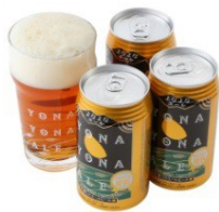
Yona Yona Ale

MBR has simplified and stabilized the WWTP operation that was formerly difficult due to seasonal variation of loading amount. Furthermore, replacement of the former hollow fiber membrane unit with KUBOTA Submerged Membrane Unit® has brought easy maintenance as expected.