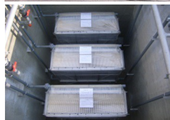
Installed Membrane Units